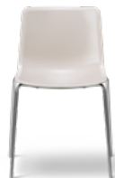
Sand 100% Post-industrial recycled PP