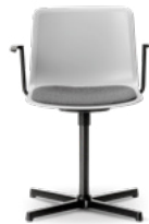
Stone 100% Post-industrial recycled PP