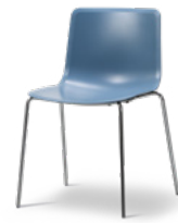
Storm 100% Post-industrial recycled PP