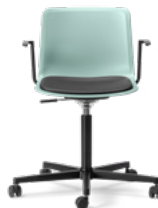
Ocean 100% Post-industrial recycled PP