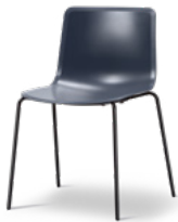
Dark Blue 100% Post-industrial recycled PP