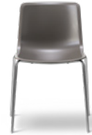
Quartz Grey 100% Post-industrial recycled PP