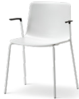
White 100% Post-industrial recycled PP