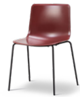
Dark Red 100% Post-industrial recycled PP