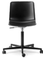
Black 30% Post-consumer recycled PP 70% Post-industrial recycled PP