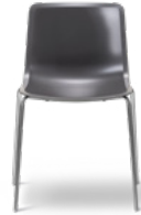
Dark Grey 100% Post-industrial recycled PP